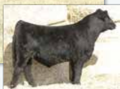
BESH Bull K87 - PE Sire