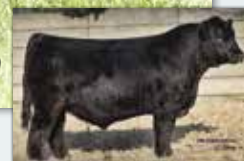
Long's/BF Entitled H15 Sire of Lots 57A, 58A, 59A, 60A