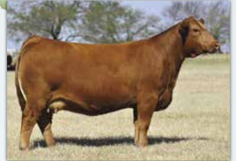
BLC1 Evelyn 476E Dam of Lot 48