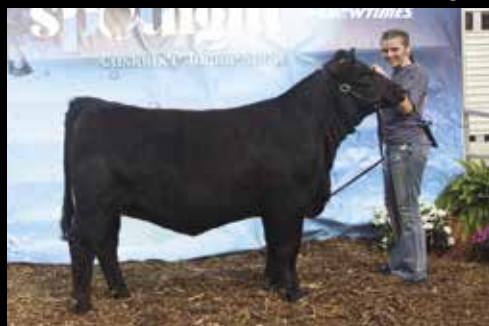
IBESH Ms Unie LA24 Eden Wehner • Percentage Simmental