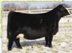
B-C Lookin Sharp 7002E Dam of Lot 50