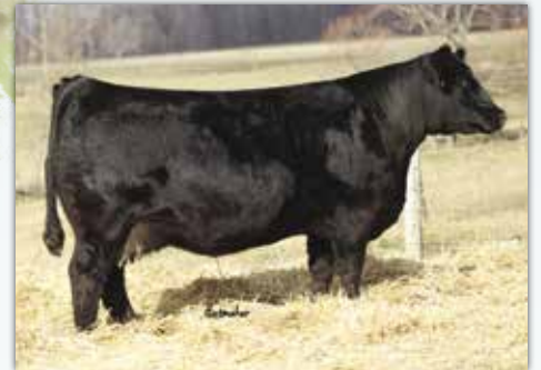
CLRWTR Sugar H4F Dam of Lot 6 Maternal Sister to Dam of Lots 6B & 7