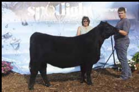
CLRWTR Reddi Or Not L532 Lane Simon • Purebred Simmental