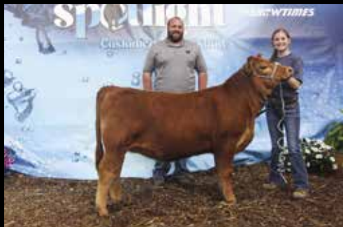
NAHF Miss Tacori 307L Laura Ellington • Purebred Simmental