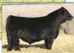
ES Five Star Limitless LJ39 Service Sire