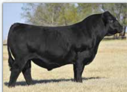
ES Right Time FA110-4 Sire of Lot 65 Embryos