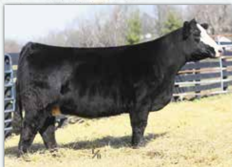
WHF Andie 365A Dam of Lots 3A - 5