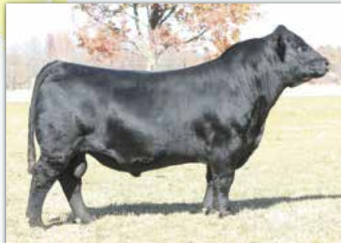
CLRWTR Clear Advantage H4G Sire of Lots 28-33