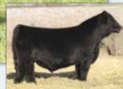
ES Five Star Limitless LJ39 Service Sire