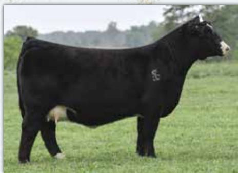
S/P True Love F789 Dam of Lots 8A, 8B, 8C, 8D