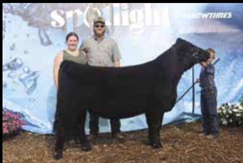
BESH Rumpel Leap Owen Smith • Purebred Simmental