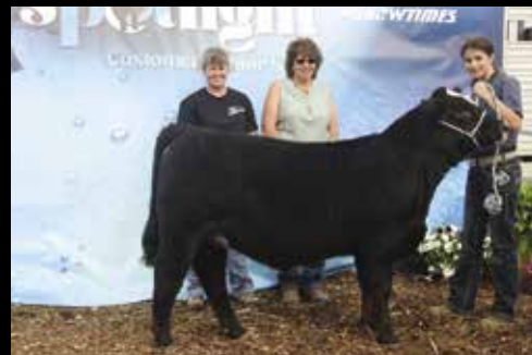
CLRWTR Dahlia L79D Taylor Ellington • Percentage Simmental