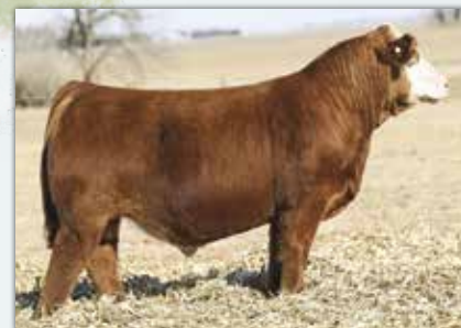
W/C Red Bird 269J Sire of Lot 64 Embryos