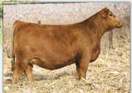
OMF/DK Josie 31J Dam of Lots 1A, 1B and 2