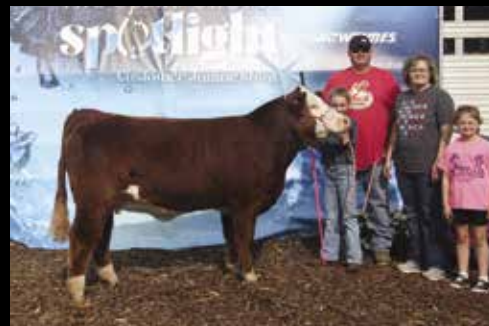
BRRN Zeta K87G Adalyn Hill • Purebred Simmental