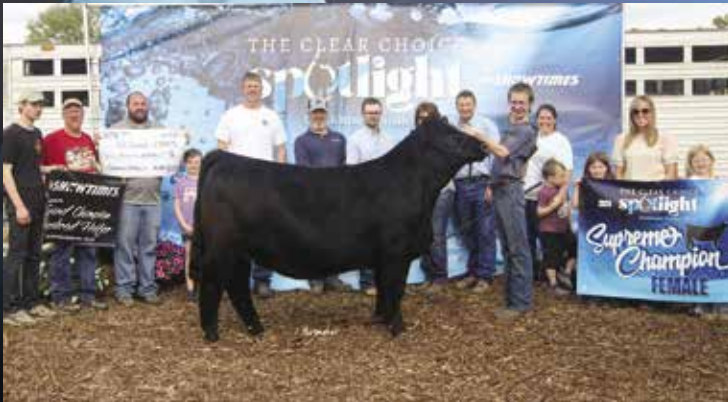
Supreme Champion Heifer • Champion Purebred Heifer BESH/WHF Ms Lucy LE19 • Cash Rumble