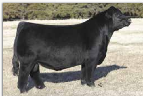
JSUL Something About Mary 8421 Sire of Lots 8-11