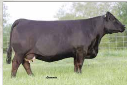
STF Onyx 451W - Dam of Lots 8-11