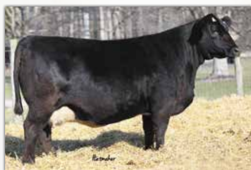
CLRWTR HTP Looking Good Dam of Lots 12 and 13