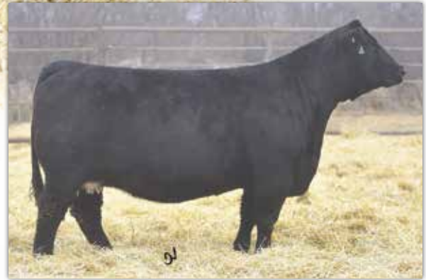
WS Miss Sugar C4 - Dam of Lots 1 and 2