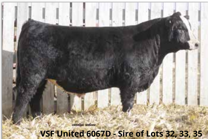
VSF United 6067D - Sire of Lots 32, 33, 35

137J is a deep red bull that will sire some high-quality replacement females! He has a pedigree full of great cow families and a great set of feet and legs to improve the longevity of any cow herd!