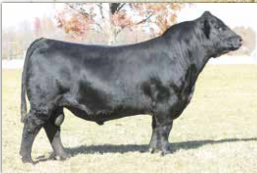
CLRWTR Clear Advantage H4G Fall 2022