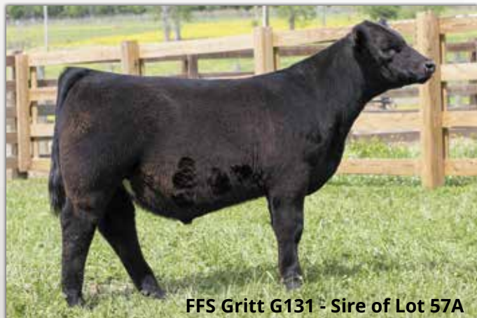
FFS Gritt G131 - Sire of Lot 57A