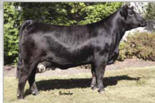
SS Emberly E303 - Dam of Lots 14 and 15