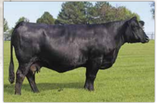
SS Cottontail 086Z - Dam of Lots 20 and 21