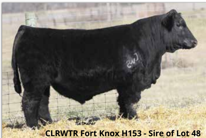
CLRWTR Fort Knox H153 - Sire of Lot 48

Breeze C74L was the first Serena daughter that we campaigned heavily with the help of Jordon Simmentals. As with any influential donor we still have the impact of Serena as well as her daughters in our herd. This Vantage Point son you appreciate out from his neck into a long spine and his depth of body. He also reads well through his EPD profile being in the top 15% for YW, ADG, DOC. Allow the influence of Serena and Breeze into your herd.