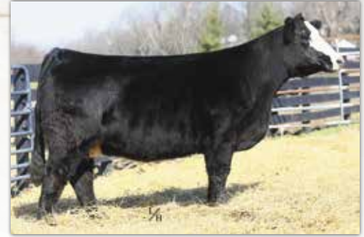
WHF Andie 365A - Dam of Lots 6 and 7