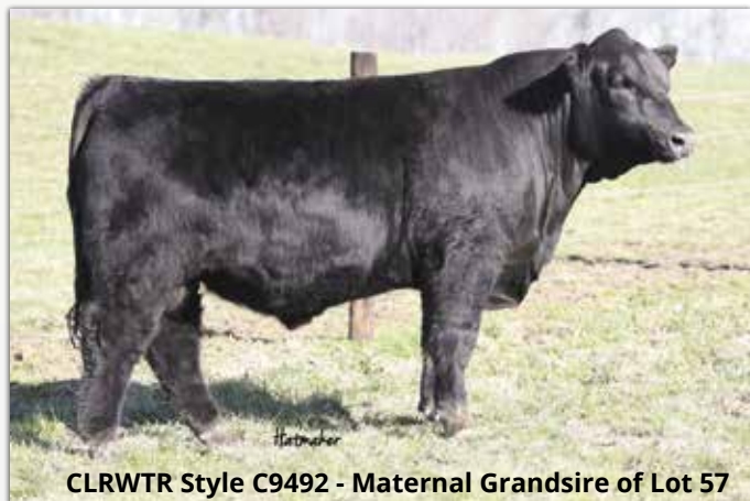
CLRWTR Style C9492 - Maternal Grandsire of Lot 57