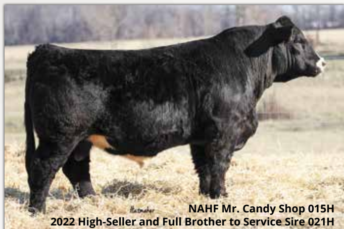
NAHF Mr. Candy Shop 015H 2022 High-Seller and Full Brother to Service Sire 021H