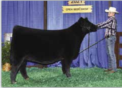
CLRWTR Beauty H317C Dam of Lot 16