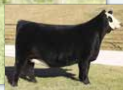
JBSF Proud Mary Dam of Lot 69