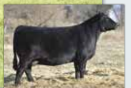
HPF Lotsa Love B422 Maternal Granddam of Lot 31

AI'd to WINC All Right (ASA# 4100635) on 4/3/25. PE to ES Five Star Limitless (ASA# 4186927) from 5/31/25 to 7/28/25. The baldie "Bug" female is one you'll notice sale day. As we've said, the Stockman progeny bring extra gas, bone, and performance. This female was impressive as a calf and hasn't changed. She's sharp fronted, with her neck coming high out of her shoulder, always carrying that alert look she's likely to pass to her offspring. She sells safe in calf to WINC All Right, the Windy Creek bull now owned by Griswold. Bug's dam, Lotsa Love, sold for $23,000 in the 2019 sale to KD Simmental in Iowa. Good things will happen here.