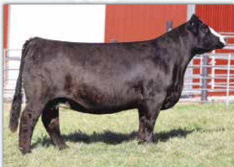
DAF Dakota D13 Dam of Lots 1-7