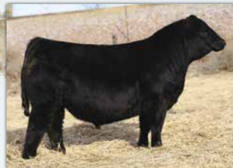
Five Star MVP M60 Sire of Lot 70 Embryos