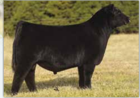
ROSE MC Encore 0463 Sire of Lots 4A-4D