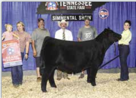
Champion Simmental & 3rd Overall Female 2025 Tennessee State Fair Full Sib to Lot 12 Maternal Sib to Lots 11, 12, 13 & 14