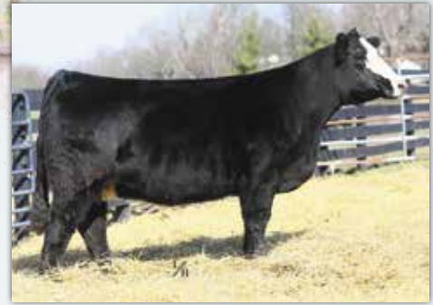
WHF Andie 365A Dam of Lots 10 - 12