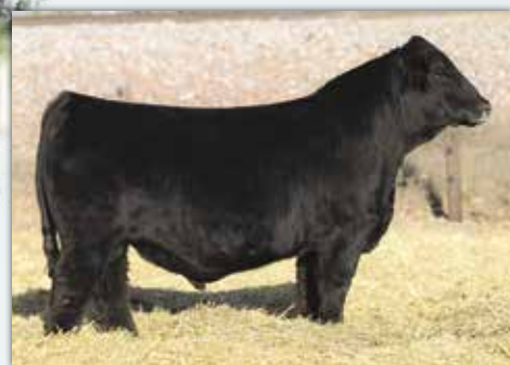
ES Five Star Limitless LJ39 Sire of Lots 8A and 8B