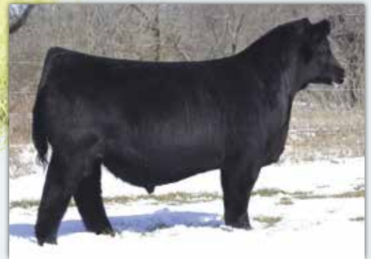
RP/BCR Eminence H005 Sire of Lot 3