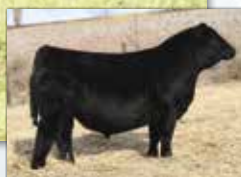
Fivestar MVP Service Sire of Lot 68