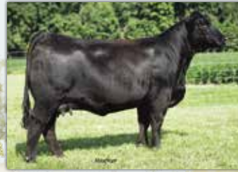
CLRWTR Ditto H79A Dam of Lots 52, 53 and 54