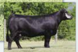
HPF Right to Love Z338 Maternal Granddam of Lot 36