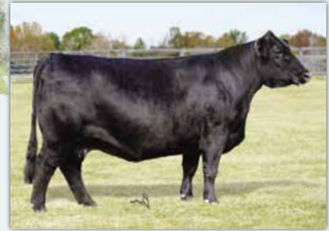
Bramlets Beautiful Z223 Dam of Lot 15