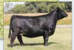
HPF Missy C068 Dam of Lot 30