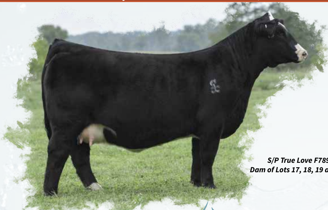
S/P True Love F789 Dam of Lots 17, 18, 19 and 20