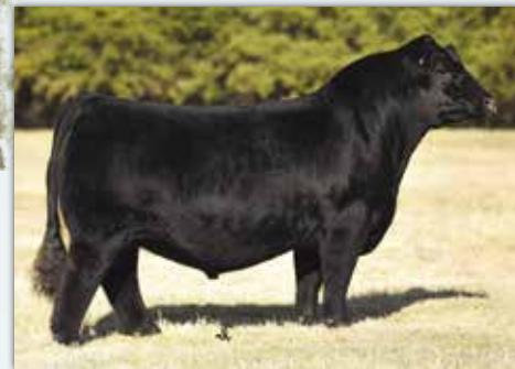
GCC Night Owl 3104L Service Sire of Lot 24 and Others