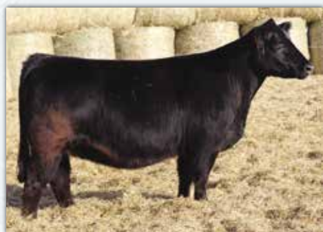
W/C Angel 7114E Dam of Lots 8A and 8B