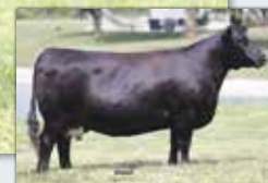
HPF Right to Love B320 Dam of Lot 21