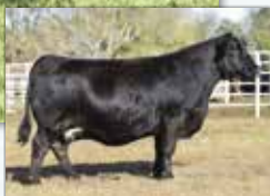
CLRWTR HTP Looking Good Maternal Granddam of Lot 26