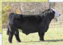
WCCO Knockin Boots 305J Sire of Lot 22