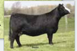
BWL Blaze of Jewel 38F Maternal Granddam of Lot 35