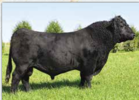
Plum Creek Paradox Sire of Lot 71A Embryos