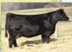
CLRWTR Sugar H4F Dam of Lot 34