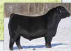
Black Ace Double Run Service Sire of Lot 42