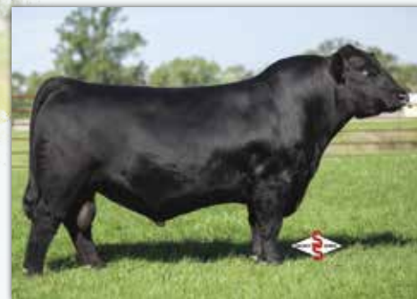
WHF Point Proven H45 Sire of Lots 1 and 2