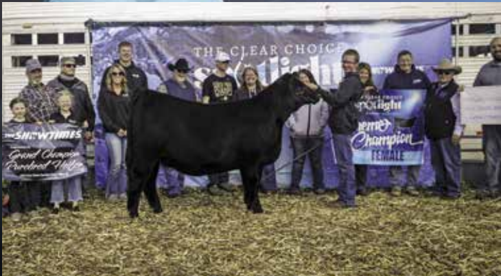
Supreme Champion Female • Champion Purebred Heifer BESH WHF Addy Lou MJU4 • Cash Rumble