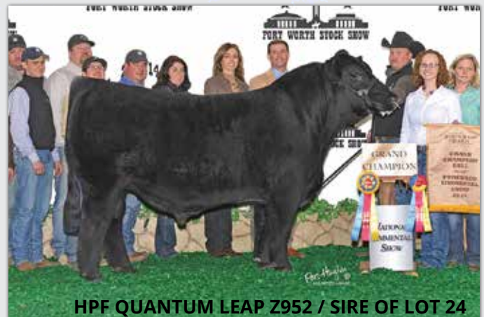
HPF QUANTUM LEAP Z952 / SIRE OF LOT 24

GEU2 is a grandson of our Miss Wisconsin donor and we see a lot of her quality traits in him. He is stout, big footed, deep, and extremely sound he should make your calves really tip the scales next fall. Semen test and BVD test results prior to sale.