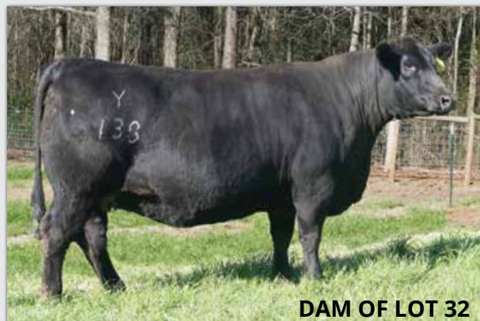
DAM OF LOT 32

This is about as good as it gets. Stout, sound, soft, with plenty of dimension. Out of the popular CDI Innovator & our Tuition Velvet cow we purchased from Whelan Farms. He also has a tremendous set of EPD's. Semen tested, BVD tested, Homo Polled by pedigree, we will have Homo Black results prior to sale.