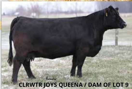
CLRWTR JOYS QUEENA / DAM OF LOT 9

We are quite proud of this one and thought enough of him to use him to clean up our fall heifers with. If you like to make cattle that are stout heavy muscled and attractive then you will love this one. His mother is probably the stoutest of our 5105 daughters she is just a beast of a cow. Homozygous Black and Homozygous Polled.