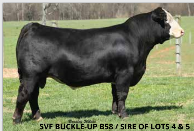
SVF BUCKLE-UP B58 / SIRE OF LOTS 4 &amp; 5

This older bull is ready to go to work. Very complete and sired by SVF Buckle-Up, who we own with Sunset View. We have been very happy with our Buckle-Up calves. Semen tested, BVD tested, Homo Polled & Homo Black results prior to sale.