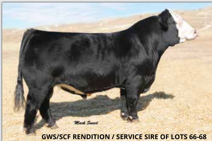
GWS/SCF RENDITION / SERVICE SIRE OF LOTS 66-68

Here is a faithful cow that has had several calves in our past sales. Ponderosa Rey and Preferred Beef. She will calve to the Saban bull that is out of the great family of Right to Love.